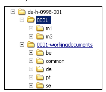
Figure 1 : Sample of folder structure

If working documents for more than one NCA are submitted on the same submission, sub folders with the country code should be used.