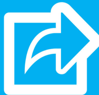
Export & Preview